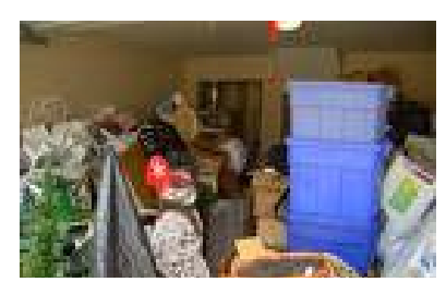
Does this look familiar? If so call today, we can unbury your life.